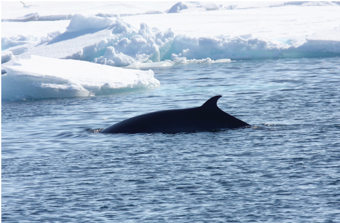
A north Atlantic minke whale off Svalbard, Norway.

In recent years, expanding whaling by Japan and Iceland has dominated both headlines and diplomacy; Japan lost a legal challenge to its special permit or 'scientific' whaling programme at the International Court of Justice and Iceland remains the target of diplomatic sanctions by the United States. In contrast, Norway has been spared international attention and diplomatic pressure, and has made the most of this vacuum. Since 2010, the Norwegian government has continued to use an unapproved method to set its quotas, and relaxed a number of whaling regulations that it originally introduced in response to criticism by the IWC. It has subsidised research into new uses of whale oil and other products and quietly prepared the ground for increased exports, resulting in nearly 150 tonnes of whale meat and blubber being exported to Japan. It has also become less transparent about the welfare implications of its hunt.