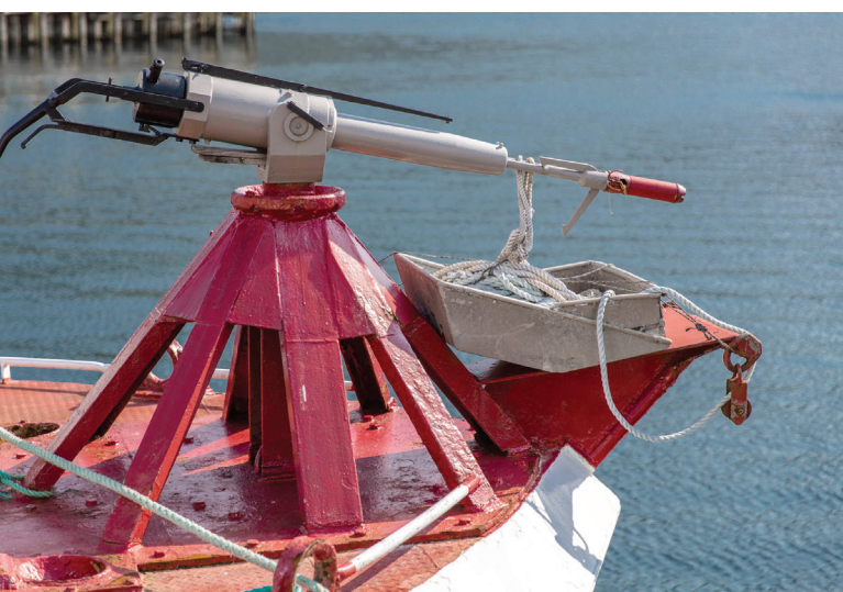
Norwegian explosive harpoon. 18 percent of harpooned minke whales in Norway do not die instantaneously.

Norwegians are split over whaling and apparently ambivalent about its humaneness; according to polls, 31 percent support whaling, regardless of potential suffering of the animals, but 42 percent oppose whaling if some whales suffer before dying. 120