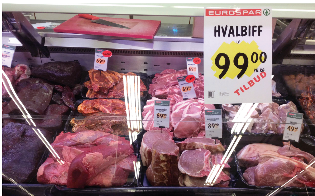
The Netherlands-based SPAR group continues to defy international condemnation by selling whale meat in its Norwegian outlets.

From 2004 to 2009, the public relations programme cost US$400,000/year. 92 Although it did not immediately result in the desired effect, 93 revenues at several of the leading whale meat companies have increased in recent years. For example, Lofothval's