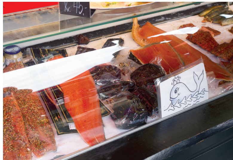
Fresh whale meat steaks on sale in 2014 at a fish market in Bergen, southeast Norway.

At its 64 th Meeting in 2012, the IWC unanimously passed Resolution 2012-1, which recalls that organic contaminants and heavy metals ' ... may have a significant negative health effect on consumers of products from these marine mammals ' and urges parties to ' ... responsibly inform consumers about positive and negative health effects, related to consumption of some cetacean products '.