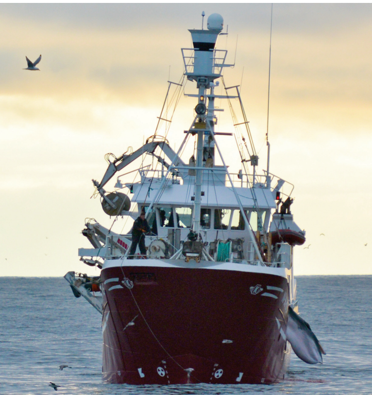
Norwegian whaling ship 'Reinebuen' south of Svalbard, May 30, 2015

For as long as Iceland and Japan continue to take all the heat for whaling and trade, Norway will maintain its business-as-usual approach to both. Strong and unambiguous diplomatic action against Norway is urgently needed, including at forthcoming CITES and IWC meetings.