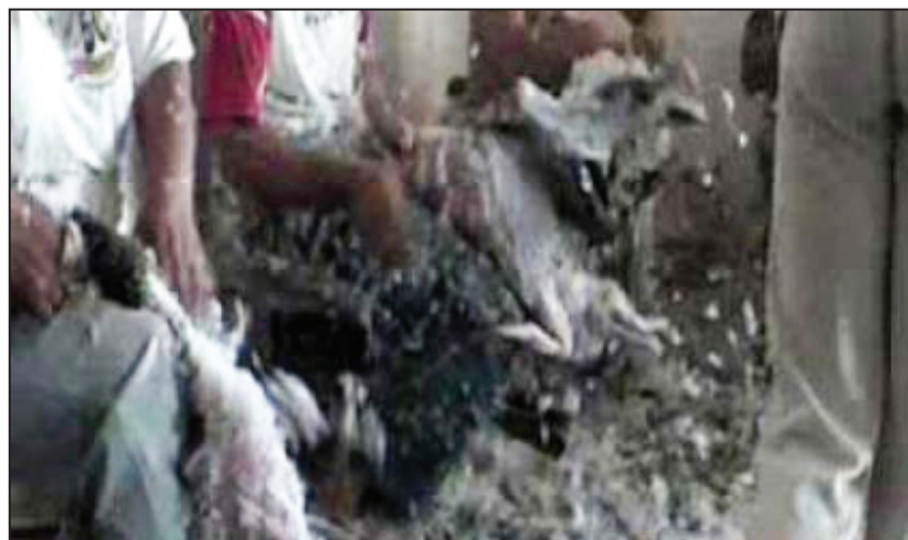
TV4 Sweden, Kalla Fakta undercover footage of live birds having their down ripped from their bodies.

The live-plucking business has long been successfully concealed from the general public. Many European citizens were first introduced to the industry by watching the much publicized television program "Kalla Fakta," a two-part Swedish investigative documentary 1 that was broadcast in February of this year. It captured the disturbing practice at a Hungarian goose farm. The tape shows birds on their backs screaming and struggling to free themselves from their tormentors as their down is ripped from their bodies at rapid speed. Afterwards, several birds are left paralyzed on the ground with large flesh wounds. The birds with big gaping wounds are then sown back