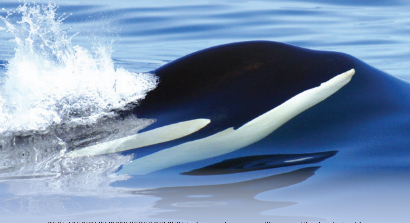
Center for Whale Research

THE LARGEST MEMBERS OF THE DOLPHIN family, orcas, also known as killer whales, are perhaps the most recognizable cetacean, with their distinctive black and white markings. These small, toothed whales inhabit temperate to cooler waters throughout the world. Today, most people know of this popular whale but many are probably unaware of the multiple perils confronting the mammals, especially those in the U.S. Pacific Northwest. There are three subspecies of these orcas: resident, transient and offshore, with different social structures, language and prey. Although their ranges overlap, they do so without aggression or intermingling among the groups.