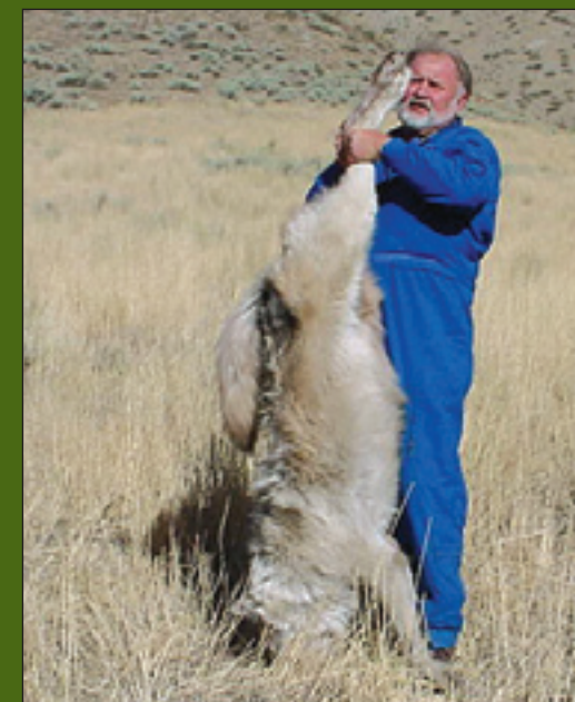
In 2008 close to 400 wolves were trapped and shot by the federal government through the USDA Wildlife Services' predator control program.

It was this very indiscriminate sledge-hammer approach to predator management that led to the extirpation of gray wolves, grizzly bears, and mountain lions from much of their former range by the middle of the 20 th century (Fox 2008). As bald eagles, wolves, swift and kit fox, and other imperiled species died by the thousands from poison baits, traps, and snares set for other species, scientists and conservationists pressed Congress to take notice and action. In 1963, Secretary of the Interior Stewart Udall commissioned Dr. Starker Leopold (son of Aldo Leopold) to chair a committee to investigate and make recommendations on the federal government's predator management program, then called "Animal Damage Control" (ADC). Out of this committee came the Leopold Report titled