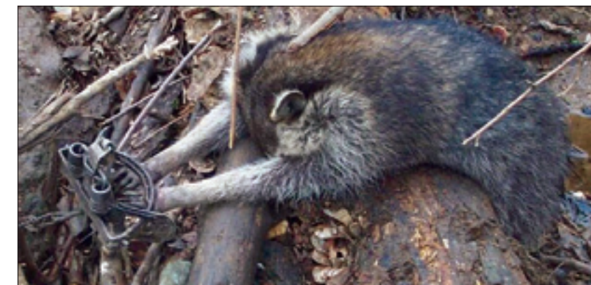
Raccoon caught by two front feet in a steel-jaw leghold trap.

CONGRESSWOMAN NITA LOWEY (D-NY) has remained steadfast in her determination to end use of inhumane traps in the United States, but has shifted the focus of her legislation to our nation’s refuges. On October 1, she introduced H.R. 3710, the Refuge from Cruel Trapping Act, a measure to end the use of body-gripping traps within the National Wildlife Refuge System. The legislation prohibits use of steel jaw leghold traps, Conibear killing traps, and neck snares within all 550 refuges, though the focus is clearly the 280 refuges that specifically permit use of these barbaric devices. As lands set aside to serve as a safe harbor for wildlife, it is appropriate to stop the cruelty inflicted by body-gripping traps within the refuges. A national Decision Research public opinion poll demonstrates that most Americans agree; 79% believe trapping on National Wildlife Refuges should be prohibited. 🐾