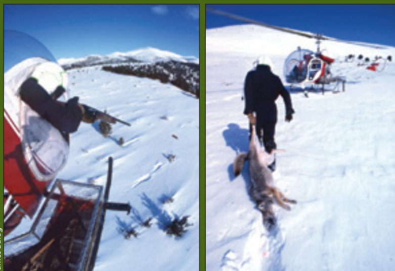
In 2008, close to 90,000 coyotes were killed by federal predator control agents, 36,454 of whom were shot from low-flight aircraft through the USDA Wildlife Services' aerial gunning program.