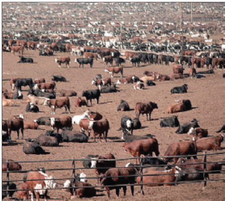
Pennsylvania Department of Agriculture

According to voluntary surveys by USDA's Animal Plant Health Inspection Service, 83% of cattle feed lots administer antibiotics in feed and water for prophylactic use or growth promotion. These drugs are identical or closely related to antibiotics used in human medicine.