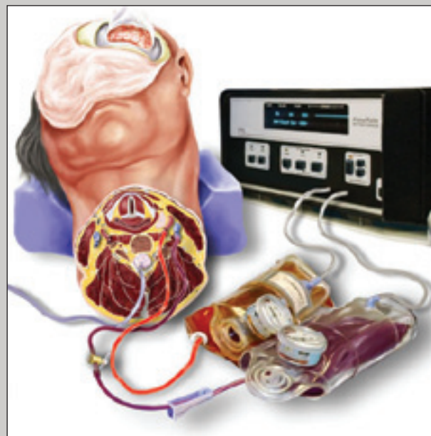
Ron Tribell/Axis Arts

Elegant in its sheer simplicity, Aboud's system involves connecting a human or an animal cadaver to a mechanical pump. Plastic tubing is spliced onto the major arteries and veins, and artificial blood is then pumped into the vessels to fill the specimen's vascular tree. The other end of each vessel is coupled to a reservoir of “blood” (water mixed with food coloring works fine). The pump can be adjusted for both pulsation speed and pressure. Clear liquids can mimic cerebrospinal fluid when working with head and spine specimens.