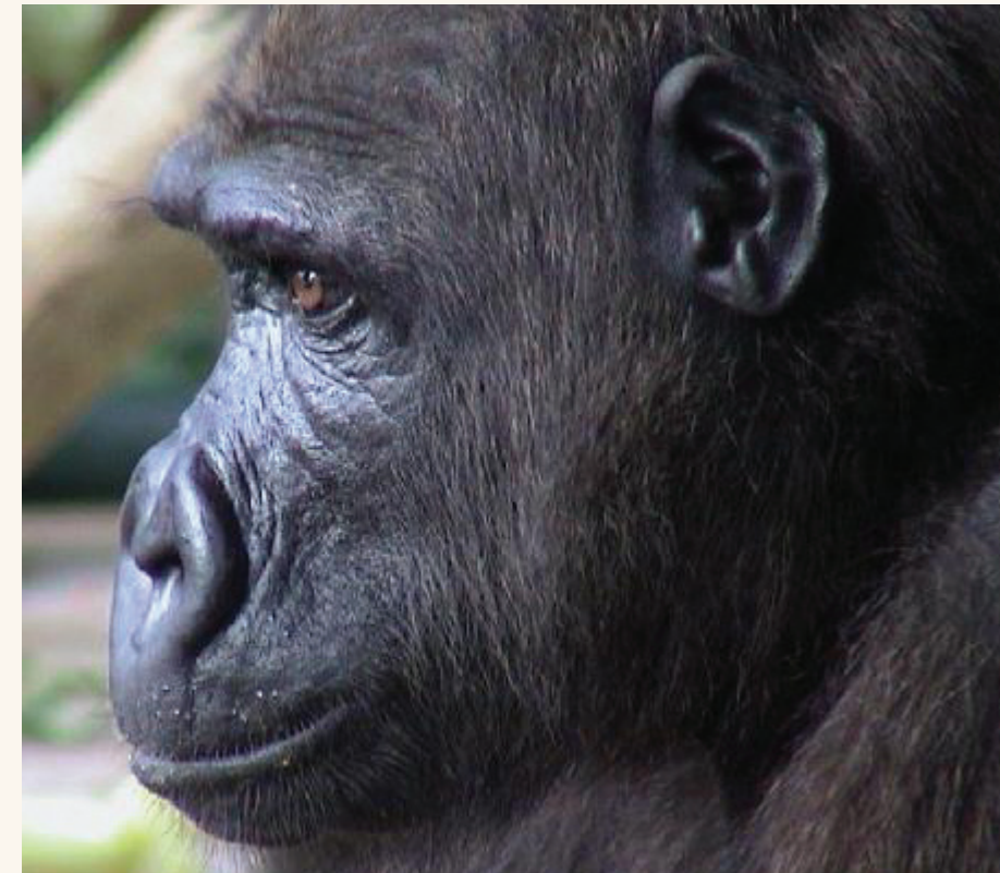
Twigs is a gorilla confiscated from a Lebanese businessman who had kept her as a pet. She has now settled in a new life at the Limbe Wildlife Center in Cameroon.