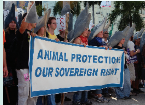
Marchers wear dolphin hats as they walk during an FTAA demonstration.