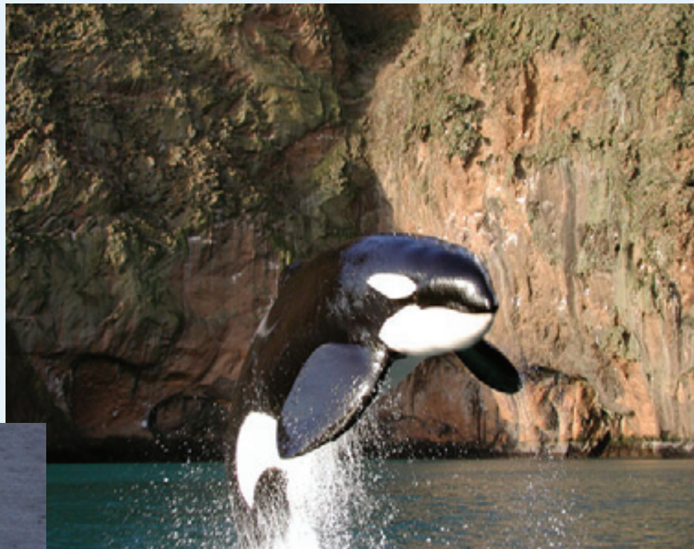
Keiko plays in Taknes Fjord—a long way from a concrete tank.

Ten years ago I led a delegation to Mexico City to negotiate with the amusement park Reino Aventura to give up Keiko the orca whale to a coalition dedicated to his release. Keiko had just become the most famous whale in the world by starring in Free Willy . When I saw him, my heart fell. He was sway-backed like an old horse because he had starved himself to shrink his Icelandic blubber and stay alive. His teeth were worn to nubbins and his gums bled from chewing on the sides of his tank. Papiloma rash spread from his pectoral fins and his dorsal fin had the trademark captive orca droop.