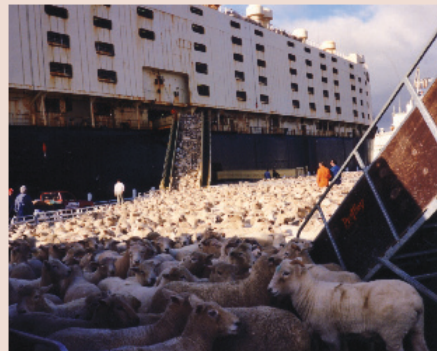
This trading of live animals is inhumane and must end. At the very least, journey length should be limited and contingency plans instituted.