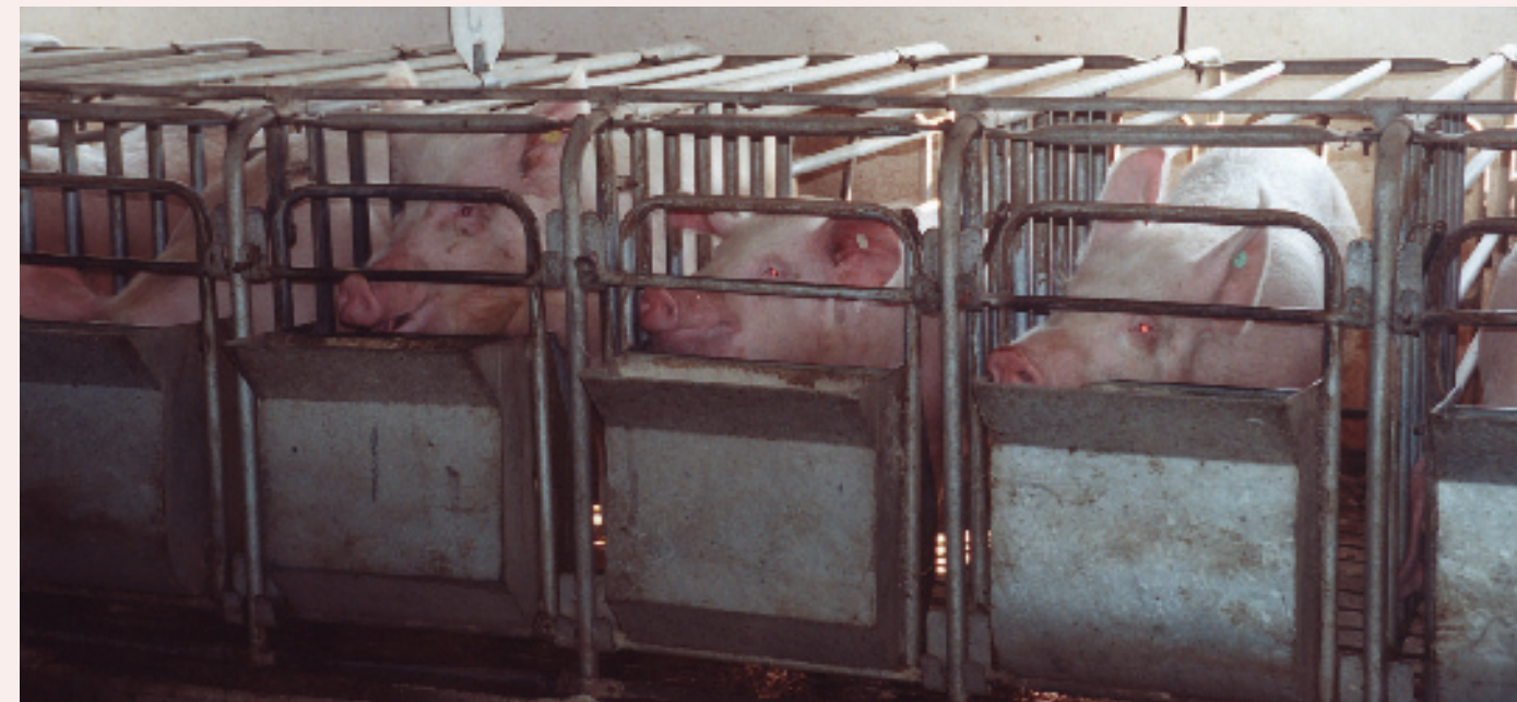
Crate-housed pregnant sows in this pig factory wait for their only feeding of the day—4 pounds of concentrate that most of them will have consumed in fewer than 10 minutes.