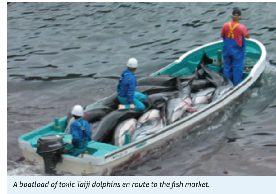
A boatload of toxic Taiji dolphins en route to the fish market.

The drive fishery slaughter in Japan has been going on for decades out of several ports, including Taiji, Iki Island and Futo. It received a