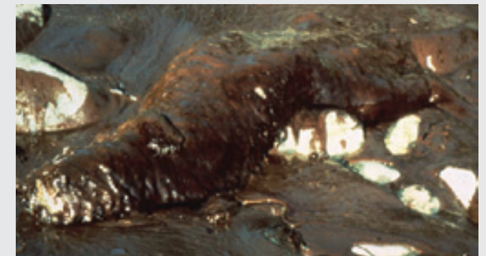
Marine mammal populations were hit hard by the spill. Thousands of sea otters (above), along with hundreds of sea lions and seals died from oil coating or from fume inhalation.

In his last book, The Demon-Haunted World , Carl Sagan made a passionate plea for keeping science honest, lest we fall into a modern version of the dark ages. Scientific reform has yet to achieve the attention it deserves, not least because scientists like to think of themselves as above all that. But without more effective safeguards, the process and indeed the products of science may become little more than a sophisticated form of advertising, and our ability to deal effectively with the host of environmental, human health and food safety problems that face us may become seriously compromised, with potentially tragic consequences. 🐾