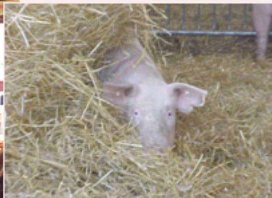
Left: Deep-bedded group sow housing on a Swedish pig farm (photo by Marlene Halverson).